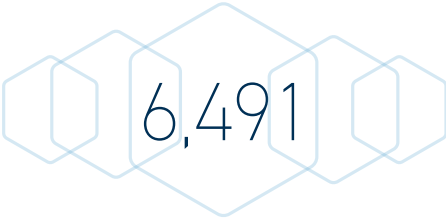
Total Alumni, including 838 in Fall 2021